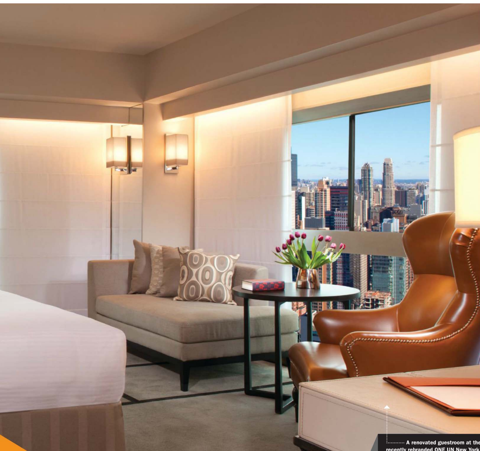
..... A renovated guestroom at the recently rebranded ONE UN New York.